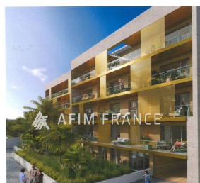
VILLA FRANCESCA - SAINT-ROMAN - ROQUEBRUNE - CAP - MARTIN